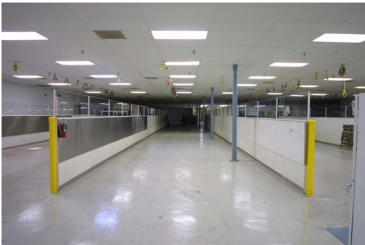
Unit 1 - Assembly Area